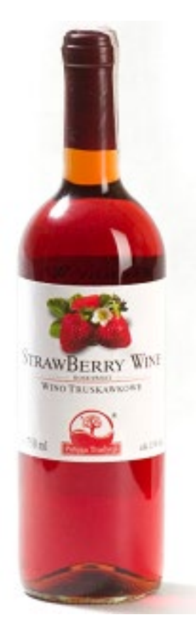
Figure 1: Polish strawberry wine

on the Labelling of Individual Types of Foods (§ 6) specifies that on the label of fermented wine beverages<sup>3</sup> obtained from musts referred to in the Wine Act and containing at least 75% of a particular fruit or juice of a fruit, the term "fruit" may be replaced with the name of the fruit used to make the must. In such instances it would also be permissible to use a graphic of the fruit named.